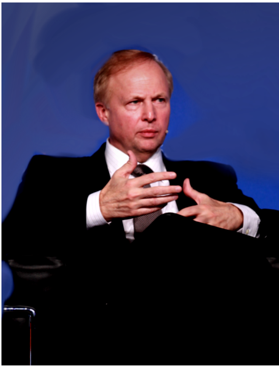
BOB DUDLEY CEO, BP

BP is one of the world's biggest fossil fuel companies. Despite its current advertising campaign, which suggests the company is taking action on the climate crisis, 97% of its capital investments remain in oil and gas. There are no plans to significantly change this. Instead, BP has committed to invest £41 billion in new oil extraction over the next 10 years